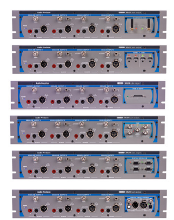
APx516B Digital Module Options